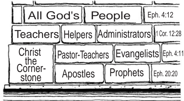
THE MINISTRY GIFTS, WITH CHRIST THE CORNERSTONE

It was he who “gave gifts to mankind”; he appointed some to be apostles, others to be prophets, others to be evangelists, others to be pastors and teachers. He did this to prepare all God’s people for the work of Christian service, in order to build up the body of Christ (Ephesians 4: 11-12).