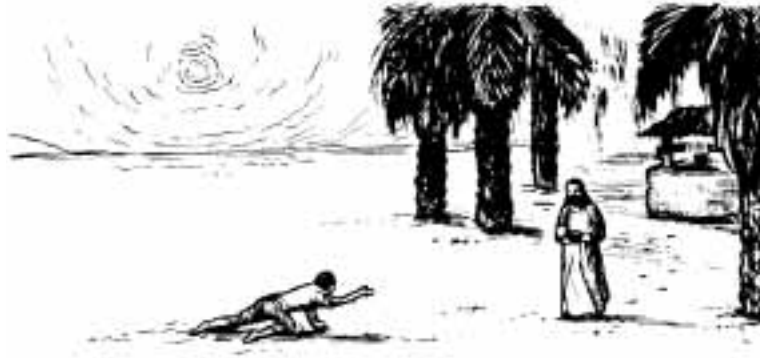
CHRIST IS OUR OASIS

The new birth means a new nature and the ability to live a life that is pleasing to God. Only the new birth can produce the holy nature in people that makes fellowship with God possible. Holiness is an absolute requirement for people to be accepted with Him (Hebrews 12:14). Thus regeneration changes the nature of people, and then their new divine life is acceptable to a holy God.