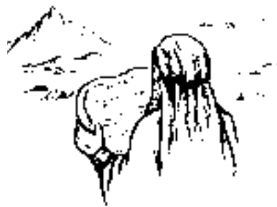
ELECTION BRINGS RESPONSIBILITY

In the above question we see divine choices which concern chosen individuals, chosen objects, and a chosen place. The word bahar most frequently refers to God’s choice of Israel as His people. No essential quality in Israel can explain why she was chosen to be God’s special people over other peoples (Deuteronomy 7:7). Israel’s insignificance did, however, give opportunity for the demonstration first of God’s grace, then of His power so that His name might be proclaimed in all the earth (Exodus 9:16). Of Israel’s election we read simply: “I have chosen you and have not rejected you” (Isaiah 41:9).