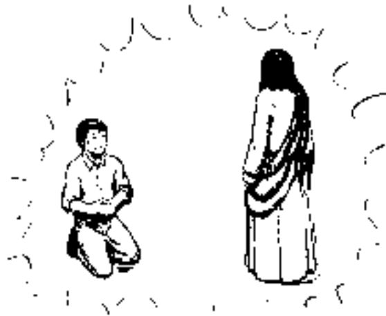
BEING CHANGED INTO HIS IMAGE

We see, then, that sanctification is neither a decisive crisis experience, nor an experience in which the believer is made perfectly sinless. And it is not empowerment for service. The purpose of sanctification is to bring the believer ever closer to the state in which his or her nature will be conformed to the likeness of Christ. As he or she walks with the Lord, the believer continues to grow and develop, and the Holy Spirit continually gives him or her light (1 John 1:7). As we walk in the light, the blood of Jesus purifies us from every sin. As the glory of the Lord is reflected from us, gradually we are changed. For we are in the process of being transformed in His likeness in an ever-greater degree of glory (2 Corinthians 3:18). So we might say that sanctification is not a certain experience , as is the baptism in the Spirit, but it is a process in which our new nature develops in us a likeness to Christ.